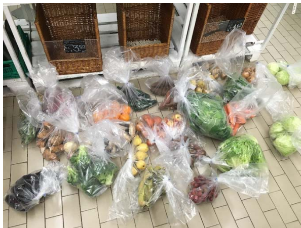
Figure 1. Food collection in supermarket.

During the first three years of the project (2017, 2018, and 2019) 120 samples of fruits, vegetables, cereals and wine were collected (Figure 1) in Terceira and other islands of Azores archipelago. In 2020, 25 samples have been collected only on Terceira Island in supermarkets and then analysed in order to investigate the presence of pesticide residues. These samples are included in the National Surveillance Plan for residues in agricultural products and were part of the official annual sampling plan for the Autonomous Region of the Azores.